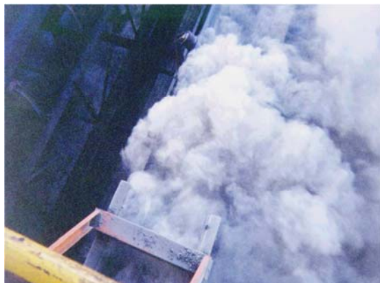
Figure 3. Dust plume due to improper transfer design

“Each operator shall continuously maintain the average concentration of respirable dust in the mine atmosphere during each shift to which each miner in the active workings is exposed to at or below 2.0 milligrams of respirable dust per cubic meter of air.”