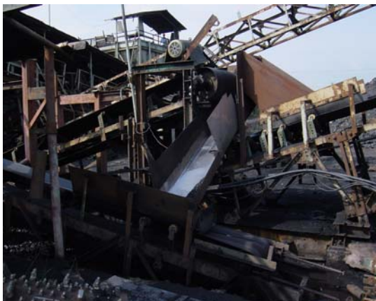
Figure 1. What can happen when transfers are not planned for.

The success of any bulk materials conveyor system is highly dependent upon the proper transfer of the conveyed material from conveyor-to-conveyor and into storage bins and stockpiles.