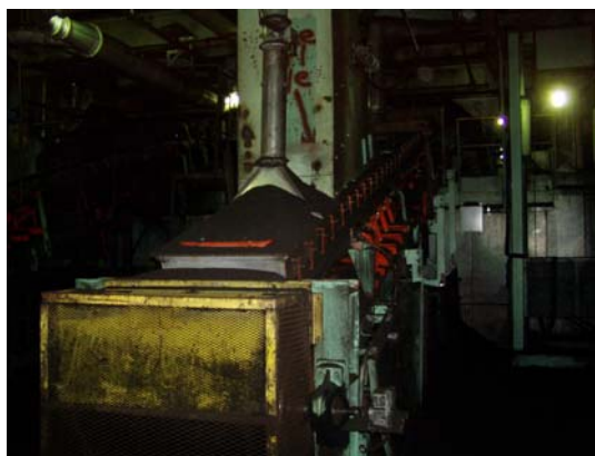
Figure 5. View of discharge portion of original transfer at Ontario Power.

According to Dave Cushing, Site Project technician-Mechanical, the main driver for the controlled flow transfer was their concern about the respirable dust levels. Even though the current dust levels are acceptable, Ontario Power was concerned that future mandated levels would be lowered and that coal available in the future would have characteristics that would create more dust during its handling. With the existing transfers in need of repair or replacement due to wear after 36 years of use, a decision needed to be made on what direction to go.