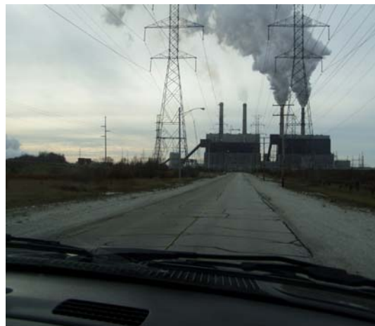
Figure 4. Ontario Power's Lambton facility

One of Flexco Engineered Systems Group's Engineered transfer installations was in March, 2004 at Ontario Power's Lambton facility in Courtright, Ontario across the border from Port Huron, Michigan. The Lambton facility is a four unit power generating facility with each unit capable of 500 megawatts. The power is delivered to the Ontario power grid. This grid supplies Ontario customers as well as, on demand, other areas such as in Michigan and New York. This facility has a total of 48 conveyors feeding coal. The Parramatta Engineered chute was installed in the gallery. The gallery has six (6) bunkers for each of the four (4) units. There are a total of 32 conveyors in the gallery feeding coal. 100 % of the coal consumed in the facility is transferred through this new Engineered transfer.