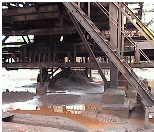
Figure 2. Spillage due to improper transfer design.

There are a number of suppliers of transfer systems, which are Engineered to handle the material in a manner that reduces or eliminates the problems listed. While each of these systems can positively affect the material transfer in many ways, this paper will deal with the mitigation of the visible and respirable dust with reduced dependence on dust collection systems.